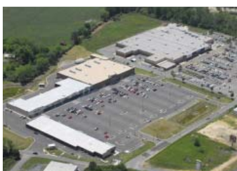
Big Springs Village Investment Sale Neighborhood Center