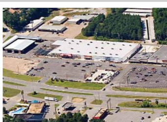
10 Property Portfolio Equity Recapture Mezz. Financing $6,000,000