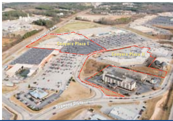
Conyers Plaza I & II Investment Sale Power Center