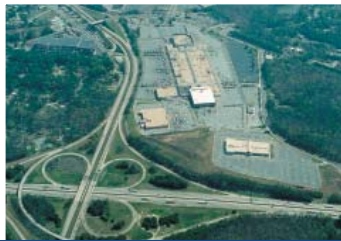
Greenbriar Mall Joint Venture Enclosed Mall