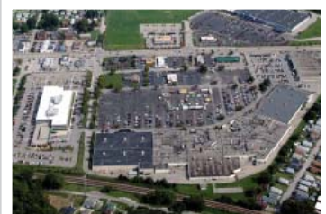
Kanawha Mall Investment Sale Enclosed Mall