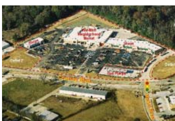
Coursey Commons Pre-Sale Neighborhood Center