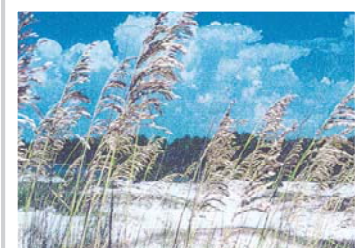
Navarre Beach Predevelopment Financing $8,750,000

An organization dedicated to the creation of wealth for its clients' real estate portfolios through trusted and innovative capital and investment solutions.