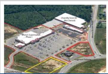
Chantilly Corners Investment Sale Neighborhood Center