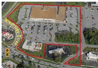
Franklin Marketplace Investment Sale Neighborhood Center