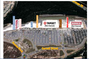
Azalea Square Private Placement Power Center